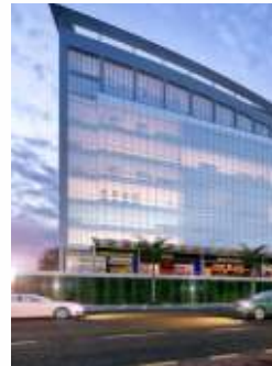
CITYSCAPE SEC 66 • GURUGRAM