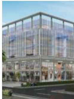
CYBERSCAPE SEC 59 • GURUGRAM