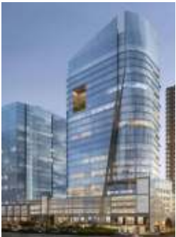
SKYMARK ONE NOIDA